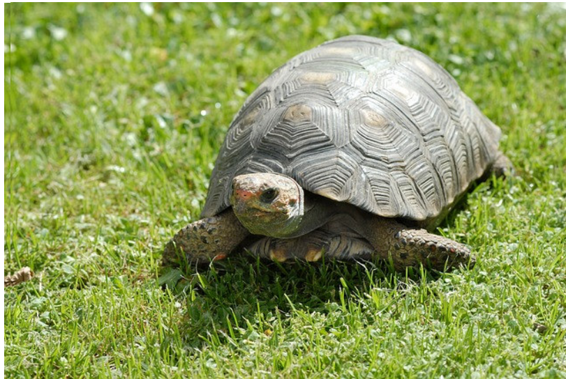
"Dieses Foto" von Unbekannter Autor ist lizenziert gemäß CC BY-SA